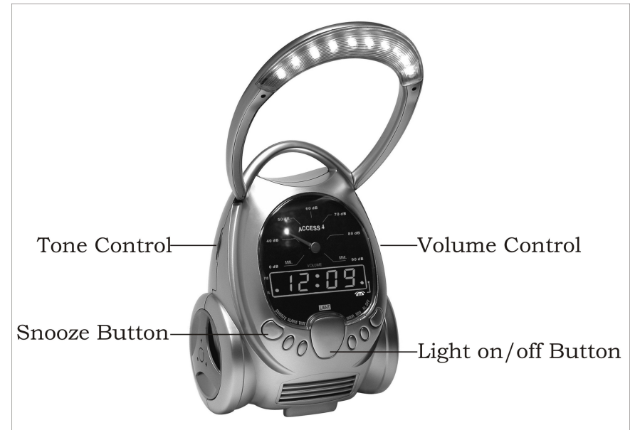
Multi-purpose Alerting Device: Alarm Clock, LED Lamp with flashing feature, Telephone Ring Signaler, Vibrator Jack.